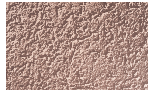
Akoya Pearl 33114