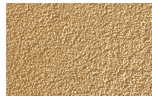
Bavarian Wheat 32113