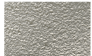
Revere Pewter 37202