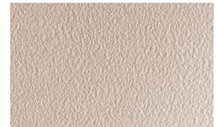
Italian Alabaster 16004